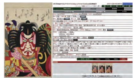
Ukiyo-e Portal Database