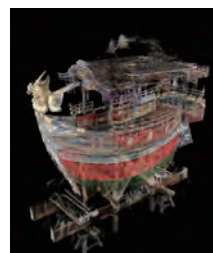
Digital-archived Fune-hoko float of the Gion Festival