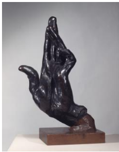
Figure 1. Kōtarō Takamura, Hand , 38.6×14.5×28.7cm, bronze, 1918 The National Museum of Modern Art, Tokyo

Figure 1 shows a sculpture of a hand by the Japanese artist Kōtarō Takamura, made in 1918. He wanted to create an even greater sculpture than that of Auguste Rodin. This hand is modeled on one of Buddha's hands, namely, the Abhaya Mudra, which means "you don't need to be frightened, relax". The Abhaya Mudra is originally a right hand, however in Kōtarō's sculpture, it is a left hand. In addition, the thumb inclines backward and the middle finger is stretched out. The back of the hand is sinewy, and the sculpture's surface is rough. If you try to create this position with your own hand, you will realize that it takes special muscular effort to achieve it. As Kōichi Watanabe says, Kōtarō's hand represents a